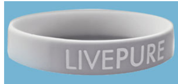
Bands available at www.pureloveclub.com

Catholic Answers, 2020 Gillespie Way El Cajon, CA 92020 Main: (619) 387-7200 Website: www.catholic.com